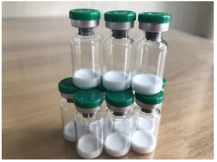
What Causes the Release of Oxytocin Acetate? Oxytocin Acetate is released:

Your pituitary gland is a small, pea-sized endocrine gland located at the base of your brain below your hypothalamus. Product Image of Oxytocin Acetate