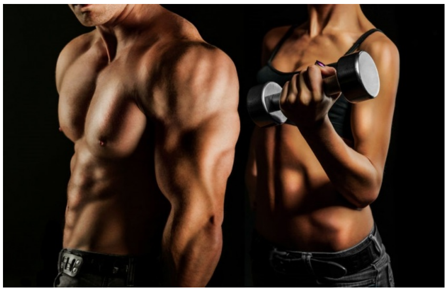
2Mg/Vial 99% Purity Peptide PEG MGF For Bodybuilding Basic Information form of PEG MGF For Bodybuilding