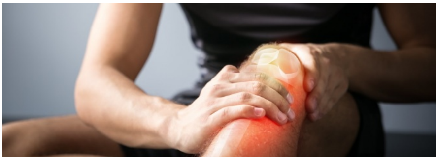
CAS 137525-51-0 White Powder GP 157 Peptide For Repair Muscle